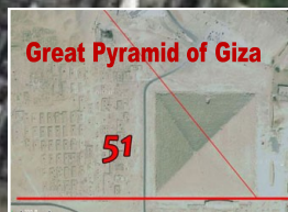
Great Pyramid of Giza

Wellington's Arch THE ANGELIC GATE KEEPER