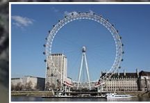
The London Eye 'M A S O N S'