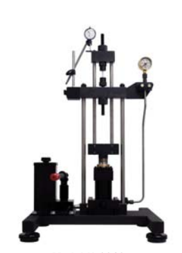
Model H-6310 Hydraulic Tension Testing Machine