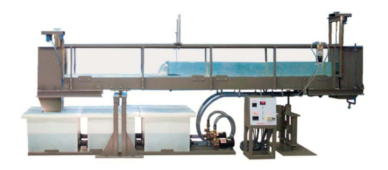
Model H-6531 Hydraulic Demonstration Channel