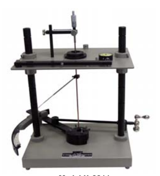
Model H-6311 Torsion Test Demonstrator