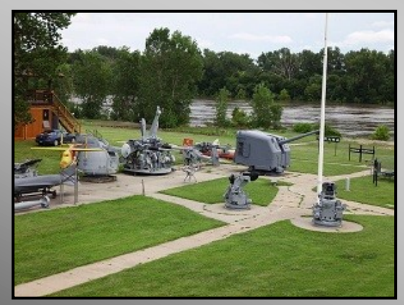
Freedom Park is an outdoor park and United States Naval Museum located along the Missouri River.