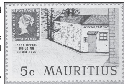
A modern issue of Mauritius depicting the famous 2d. 'Post Office' stamp and the Post Office building as it was before 1870 (SG 419)