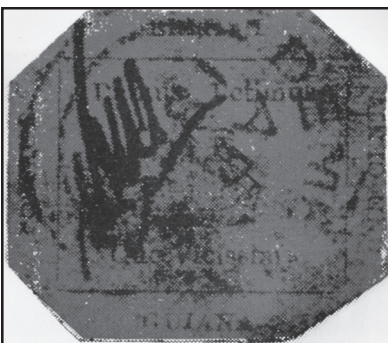
Above: The world's most famous stamp, the 1c black on magenta of 1856, British Guiana (SG 23).

'The World's Rarest Stamp' – a unique distinction – is this stamp. The story begins early that year when the current stamps became exhausted and further supplies of the regular 'Ship' issues from Waterlow and Sons were delayed.