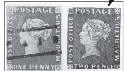
The famous 1d, and 2d. 'Post Office' stamps of Mauritius—the first issue of 1847 (SG 1 and 2).

Barnard printed 500 each of the 1d orange-red and 2d blue stamps directly, one at a time, from the plate, and they were placed on sale 21 September 1847. The entire issue sold in a few days and nothing was heard of them until years later. A cover with both the 1d and 2d stamps sold for US$3.8 million in 1993.