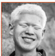
Jackson "Jack" Lambert