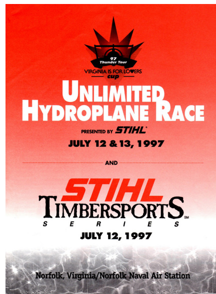
1997 Virginia is for Lovers race program

Yes that's true, but I would tell you that the venue and event, especially the one Seattle provides a potential race fan, is spectacular. Between the log boom, the Blue Angels' show, the music, everything that Seafair brings to the party. It's pretty significant and should bring a lot of people down to the lake. The cost for the amount of entertainment available is unmatched. Overall, I believe the popularity of the unlimited racing has declined because it's too long a day. People come down with family and young kids and really, for the amount of racing they actually see in six hours, well it's a pretty big commitment. One of the things that I would be in favor of is that you shorten the race day. You shorten the period in which they race and try to run more heats within a tighter period of time. I think that would be a lot more entertaining for the fans. I've heard rumblings that they're going