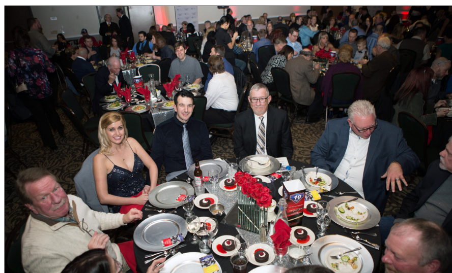
The U-21 Go Fast, Turn Left Race Team.