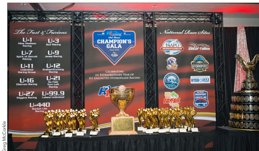
The trophy hardware ready to be presented.

paper, the Tri-City Herald , always promotes the Tri-Cities as Hydro Town; they are right!