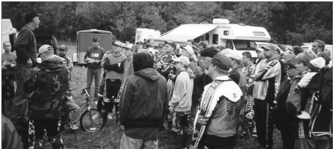
The riders meeting at the Collins enduro was quite a contrast from previous riders meetings. Instead of looking for shade, they were looking for rain gear.