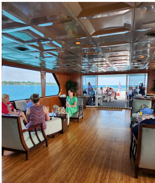
Inside the Infinity on the top deck.