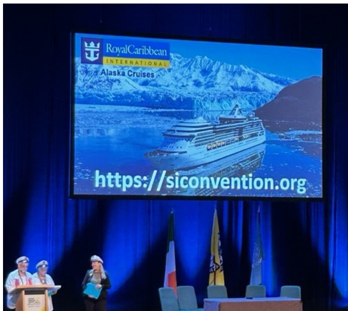
Next SI Convention will be an Alaskan Cruise aboard the Royal Caribbean! https://siconvention.org