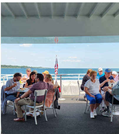
The stern of the yacht is outdoors.