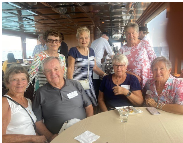
The Lakepointe Towers Condo group: