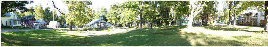
Camp Etna's Common Green