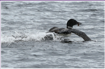
Loon on the pond with lunch