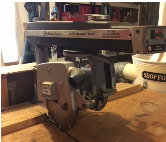
Black & Decker 10" Radial Arm Saw on Stand