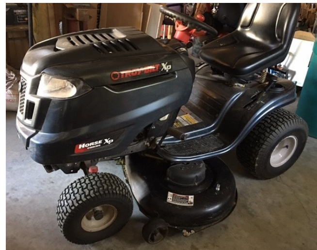
Troy Bilt XP Horse Hydrostatic Lawn Mower, 46" Electric Limb Saw Poulan Gas Chain Saw MTD 5 HP Tiller Lawn Mower lift Cedar Chairs Cedar Loveseat Rockers Porch Swing Patio Set Swing on Stand