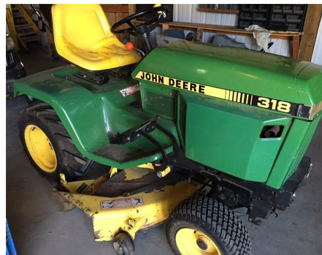
John Deere 318 Hydrostatic Mower, 46", with Snowblade and extra Wheels and Tires