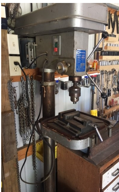
Set of Lathe Chisels Skil Bench Grinder on Stand Chicago Bench Grinder on Stand