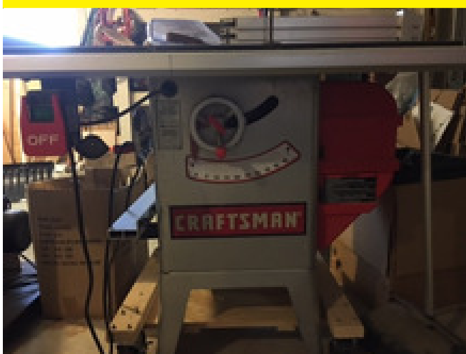
Craftsman 10" Table Saw, 1 ½ HP Induction Motor, Dust collector plate, on Rollers Shop Fox Dust Collector, 1 ½ HP on Rollers