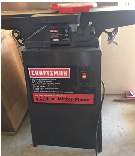
Craftsman 6 1/8" Jointer/Planer Dewalt 12" Thickness Planer Lincoln Electric Welder, 225 Amp Auto Darkening Welding Helmet