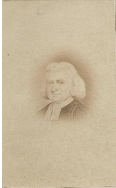
John Wesley (1703-1791)

The Evangelical spirit also manifests itself in the Methodist Church, which comes to America in 1736.