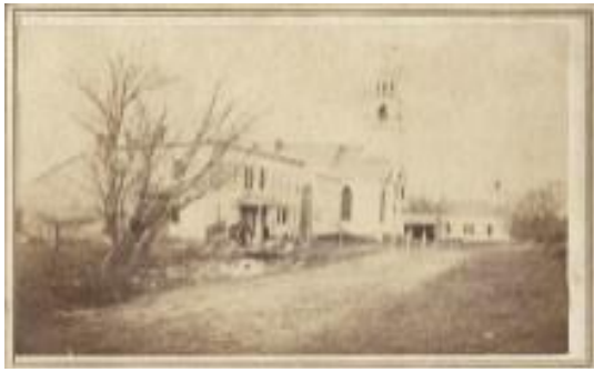
An Early Church in Dunbarton, New Hampshire

The general effect of the Enlightenment is to awaken individuals to the notion of self-reliance – that by using their own capacities of reason, they can re-shape their societies and personal destinies.