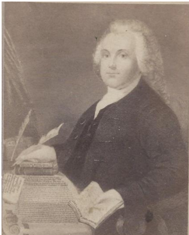
Roger Williams (Baptist)(1603-1683)

Effects of the Protestant Reformation and the Enlightenment movements in Europe spill over to the religious environment developing in America.