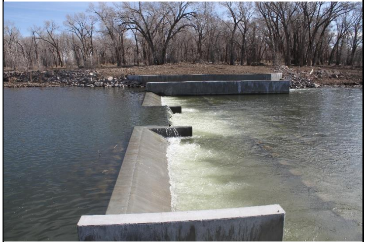
Diversion dam on Rio Grande