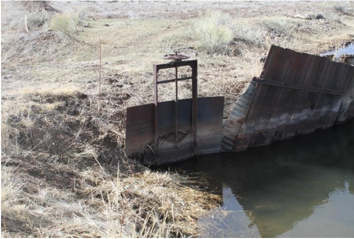
Headgate looking downstream