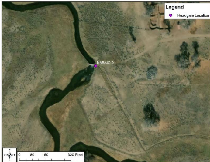
Aerial image showing headgate and diversion dam