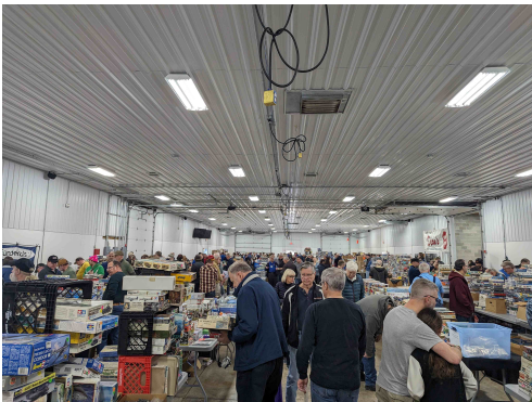
A very busy Vendor room at the Roscoe Turner Show.