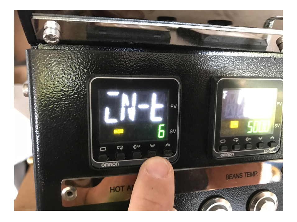
# 6 This should allow Omron to read the new K Type thermocouple

The first menu setting is the one you need to change the thermocouple type. Regardless of the number it shows switch to this setting: