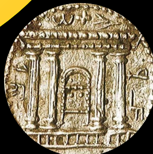
ANCIENT COIN WITH IMAGE OF TEMPLE