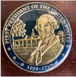
George Washington Front