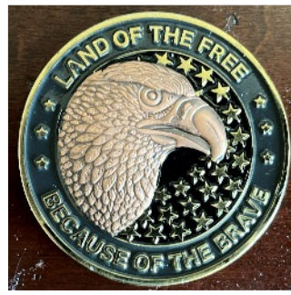
Land of the Free Because of the Brave