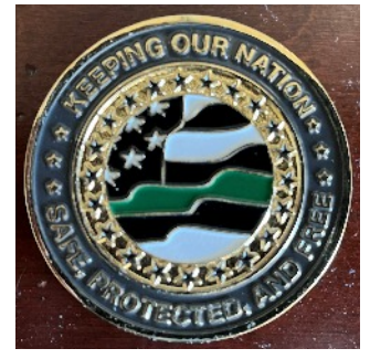
Keeping our Nation Safe and Free