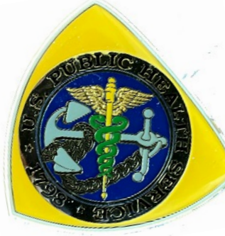
Public Service Front