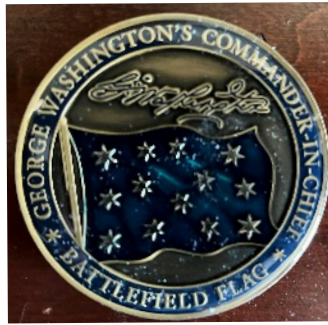
George Washington Back-Battle Flag