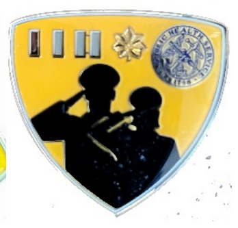
Public Service Back