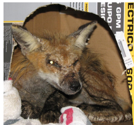
Medicine $2. Nutrition $200.

Baby season usually starts mid to late April, but this year has gotten off to an early start. The beginning of March brought us four baby raccoons. So now we're busy getting ready for the numerous baby foxes, songbirds, birds of prey, raccoons, rabbits and opossums who will be coming our way!