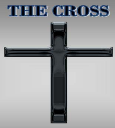
CHURCH WHERE EVERYBODY IS SOMEBODY AND CHRIST IS LORD OF ALL"