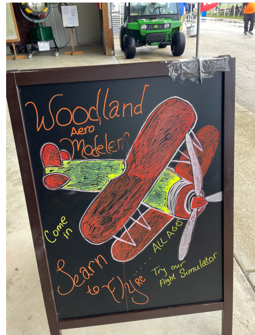
Many thanks to Tim's sweetie for our sign!