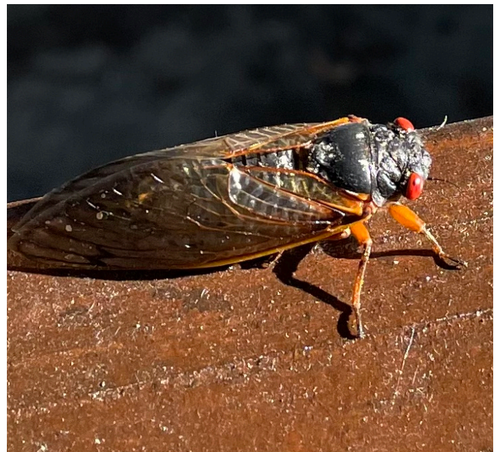
A Cicada on a flight stand ready for takeoff