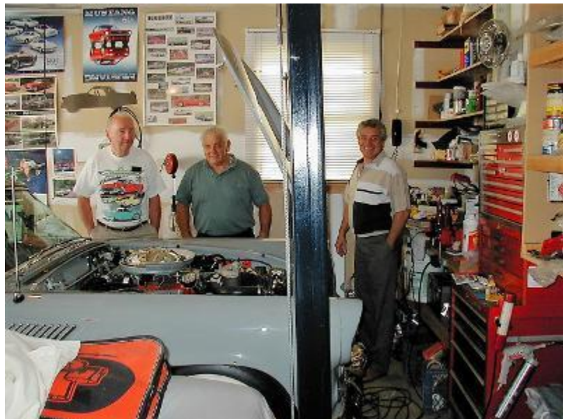
An oldie from 2003