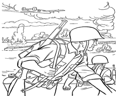
During WWII American forces landed on the beaches on D-Day, June 6, 1944