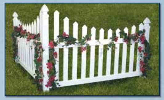
1<sup>1</sup>/<sub>2</sub>" OR 3" CLASSIC PICKET ACCENT CORNER 6' Sections in White & Tan