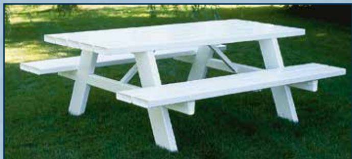
VINYL PICNIC TABLES 6' Long, 8' Long in White & Tan