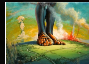
The Last Beast