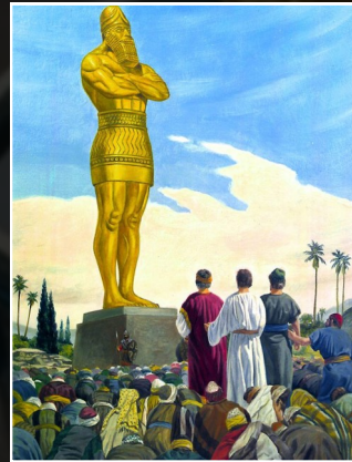
The Plain of Dura

Bible experts believe that as it pertains to Saturn's mythology, it goes back farther than that of the human history records. Based on the notion of Earth's earliest stages, Lucifer was attributed with the characteristics of Saturn. Lucifer was perhaps the god and ruler of the Golden Age of Aquarius on Earth and commander of the Titans with his 7-ray crown as Saturn also has 7 primary ring groupings, A-G. It is interesting that many of such statues that rulers of world empires as types of 'Beasts' have erected over the ages have this 7-ray crown depiction of the Sol Invictus, the Unconquerable Sun. In Luciferian circles, Lucifer is the Sol Invictus, in direct competition to the Son of GOD, Jesus Christ.