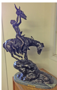
Calling The Buffalo Bronze

We will be starting at 6 p.m. with the North American Indian and Western Gallery then at 7 p.m. we will be on the saddles and tack. Doors will open at 5 p.m. for preview.