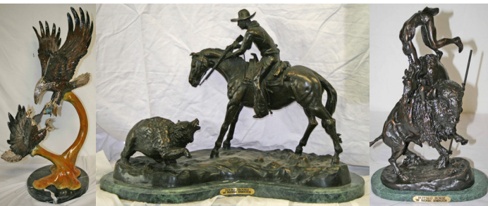
Approx 24 Different Bronzes