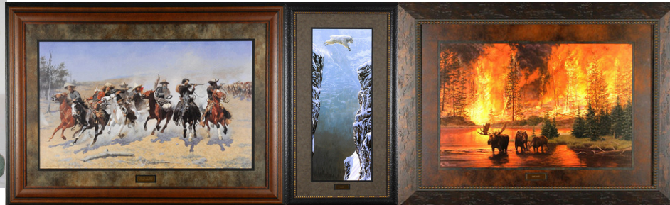
Over 60 Different Framed and Matted, Open and Limited Edition Prints.