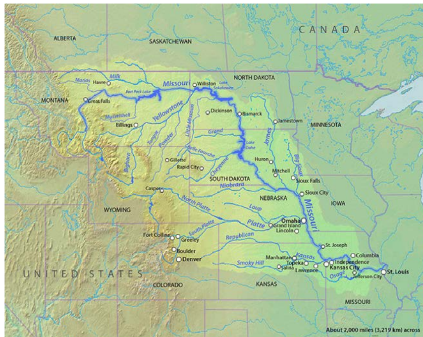
The Mighty Missouri River Stretching 2341 Miles from St. Louis to Three Forks

Only a month later, on August 17, their hopes for a Northwest Passage to the Pacific are over, as they discover the “end point” of the Missouri River, the headwaters at Three Forks, Montana.