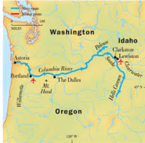
The Columbia River Running Inland from the Pacific