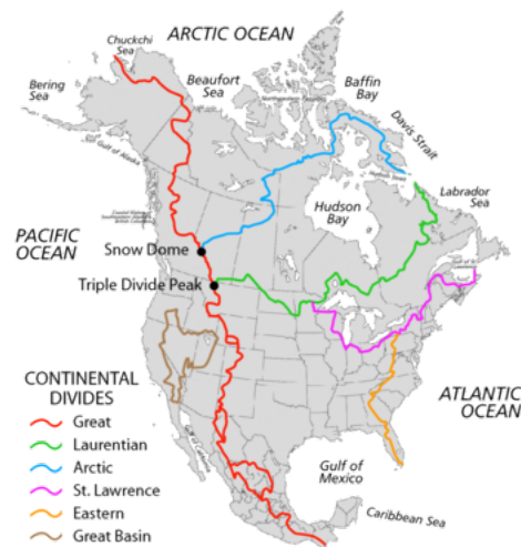
The Great Continental Divide of North America

At this point they are 15 months into a journey that was supposed to take a year. Undaunted, they push on to perhaps their most formidable challenge, crossing the Rocky Mountains – the Great Continental Divide, where America’s waterways (and river currents) begin to flow advantageously west toward the Pacific. Lewis and Clark will be the first white Americans to cross this divide.