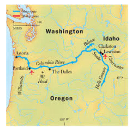
The Columbia River Running Inland from the Pacific