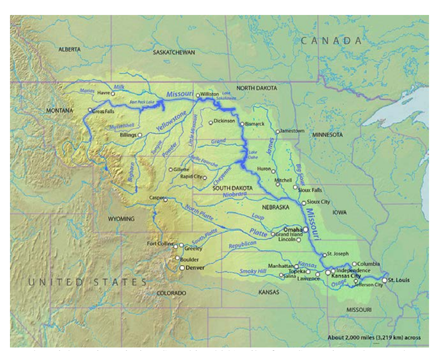
The Mighty Missouri River Stretching 2341 Miles from St. Louis to Three Forks

Only a month later, on August 17, their hopes for a Northwest Passage to the Pacific are over, as they discover the "end point" of the Missouri River, the headwaters at Three Forks, Montana.