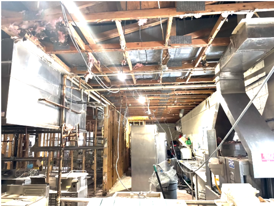
AFTER THE DEMOLITION