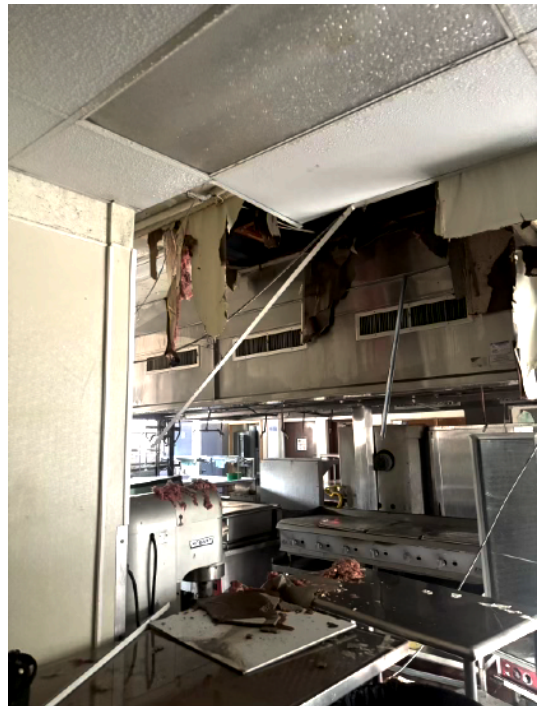
THE DAMAGE WHEN FIRST DISCOVERED