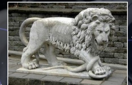
Leo crushing head of Hydra, astrologically.