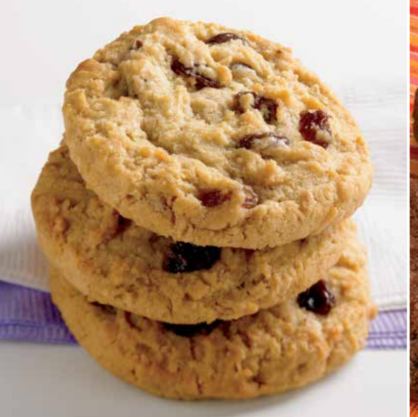
802 - Oatmeal Raisin

Avena y pasas Rolled oats, plump California raisins and aromatic cinnamon spice combine for a delightful taste that provides the ultimate comfort of home. Approximately 36 cookie dough pieces per carton.