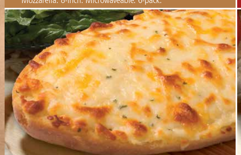
363 - Five Cheese Garlic Bread Pan de ajo con cinco quesos Mozzarella, provolone, yellow cheddar, white cheddar, and romano. 8-inch. Microwaveable. 6-pack.