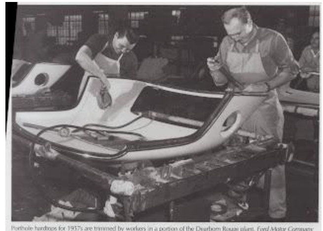
Port-hole handgrips for 1957s are trimmed by workers in a portion of the Dearborn Rouge plant.