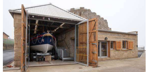
East Durham Heritage and Lifeboat Centre

Or perhaps you want to kick off your shoes and feel the sand between your toes on the beautiful Slope Beach.