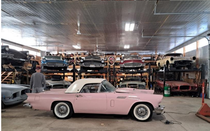
Remember Pearl harbor - Dec. 7, 1941