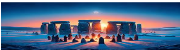
Winter Soltice 12/21 Shortest day of the year