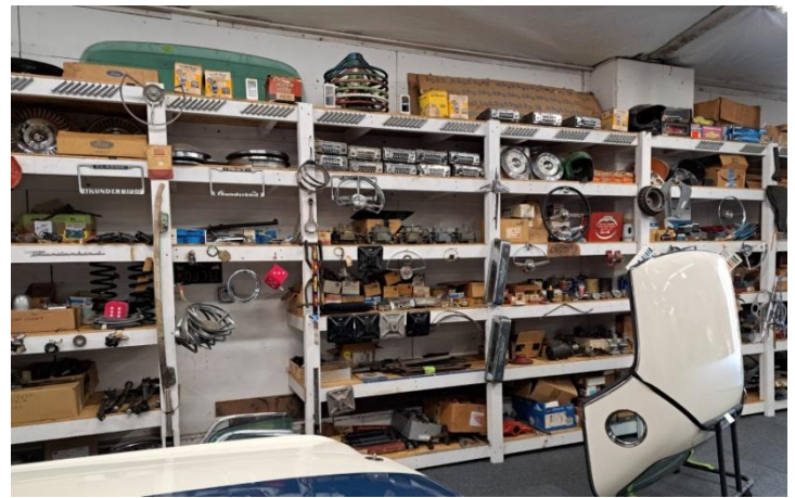
Parts anyone? Just a small sample