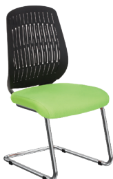
WE-H-2 A : 20" C : 18" E : 22"