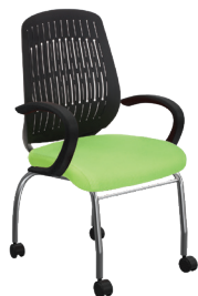
WE-H-4 A : 20" C : 18" E : 22"