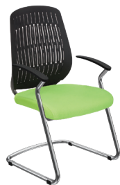
WE-H-6 A : 20" C : 18" E : 22"