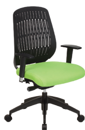
WE-H A : 20" C : 17" - 22" E : 22"