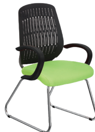
WE-H-3 A : 20" C : 18" E : 22"