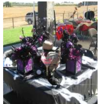
Amazing Table Decorations!

Your Help is Needed - Sponsor a Bunko Table today! Contact Judy Elam at 209-613-5659