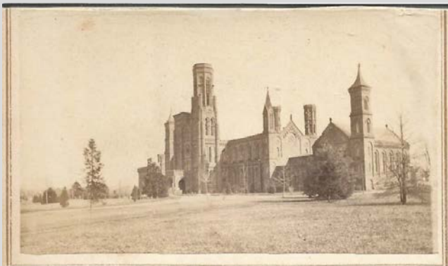
Original Smithsonian Institution Sitting Alone On The Future Mall

The challenge of housing artifacts brought back from the Exploratory Expedition provokes an end to the back and forth political haggling about how best to utilize a monetary windfall arriving in America in 1835.