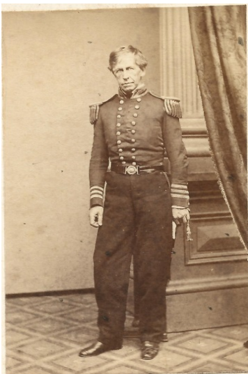
Charles Wilkes (1798-1877)

On June 10, 1842, just as Fremont is starting his journey west in Kansas, another adventurer, naval commander, Lt. Charles Wilkes, sails into New York harbor after completing a four year trip to navigate the globe.