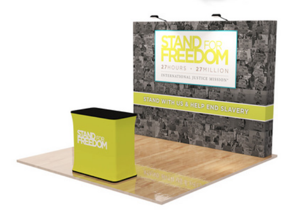
*Podium optional - Wood floor not available