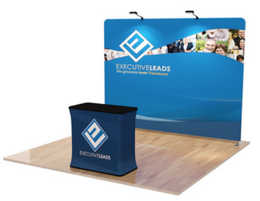
*Podium optional - Wood floor not available

Available in 8ft ($985) & 10ft ($1175) Add the Hard Case with Podium Wrap for only $395