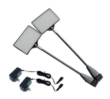
2 LED lights included in this package

Available in 8ft ($948) & 10ft ($1120) Add the Hard Case with Podium Wrap for only $395!