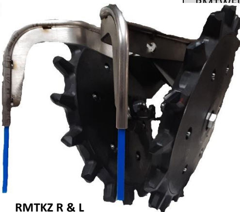
RMTKZ R & L