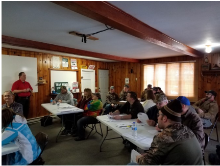
South Dakota Enhanced Permit to Carry Concealed Class

Our business was established in 2012, to provide quality firearms training to South Dakotan's. We provide a wide range of courses for students of all skill levels in a variety of shooting disciplines. Our Certified Instructors are retired law enforcement officers who have years of experience teaching law enforcement officers defensive shooting skills for self-defense. Since our opening in April of 2012 Schlueter Firearms Instruction and our in-