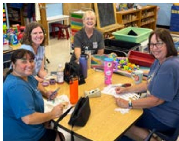
Staff return to their classrooms. Above: The preschool staff prepare for school to start. Below: Teachers meet together before classes begin.