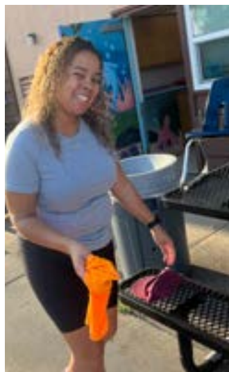
Beautification Day - Our school work party was a beautiful day of hard work, blessings, and fellowship.