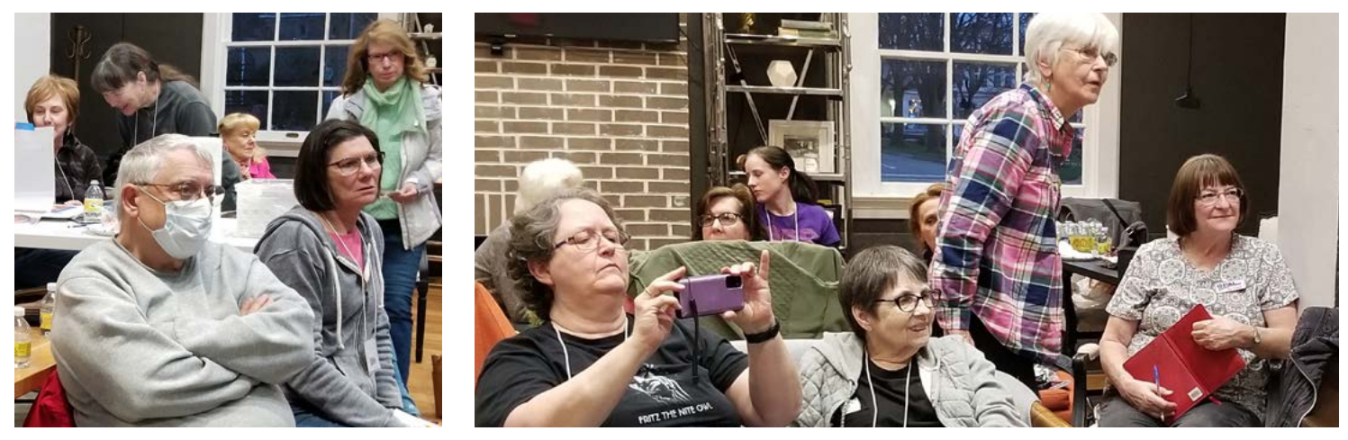
OPAL members enjoying the demo at the beautiful Co-Hatch space in Worthington.

PAPER - PROPORTION - TECHNIQUE Members were able to paint-along as Angela showed studies on a variety of papers and showed examples ranging from monochromatic to full color studies. She also reviewed some of the guiding principles of proportion on the face: eyes-nose-mouth, eyebrows and ear alignment, and to think of the teeth as "shapes" rather than individual teeth. Additional notes: remember that children's features are softer than adults; start with darks then move to "lights;" and that it's often helpful to look at your piece upside down or in a mirror to assess proportions.