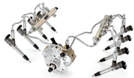
Variety of High Pressure Common Rail Injection Pump & Injectors