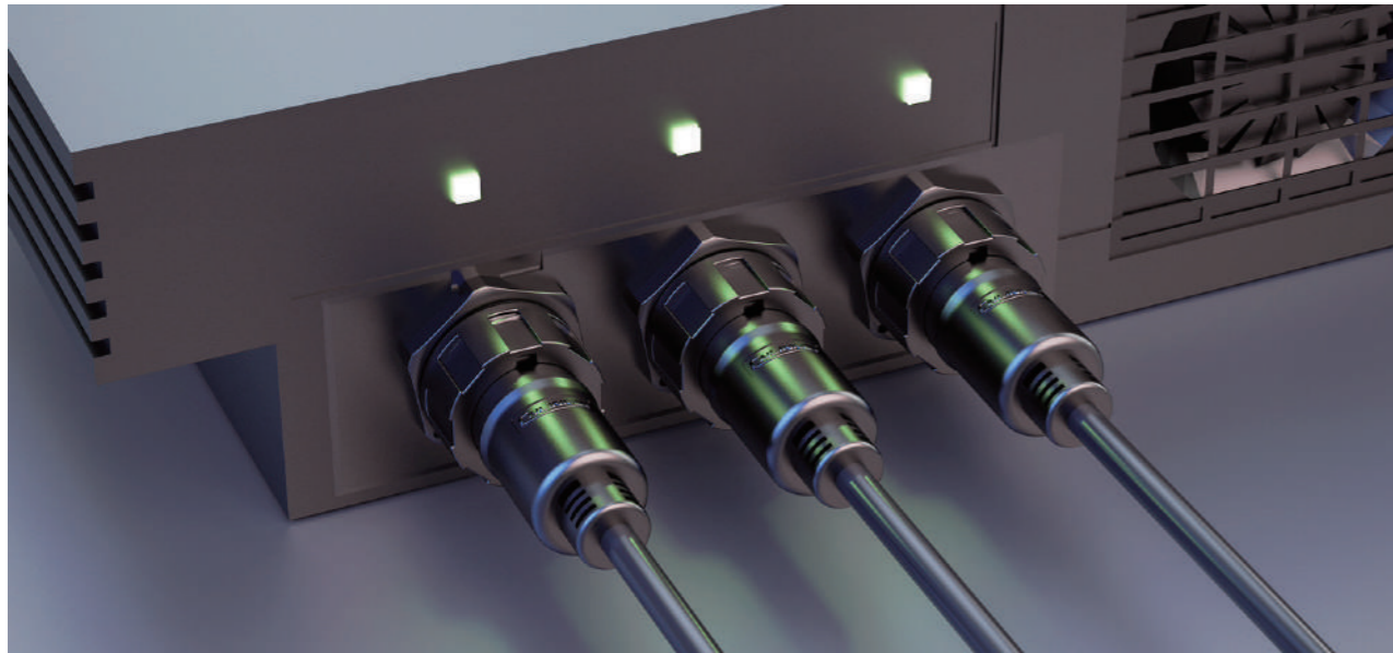
YU-USB series products are used in an automation equipment control box