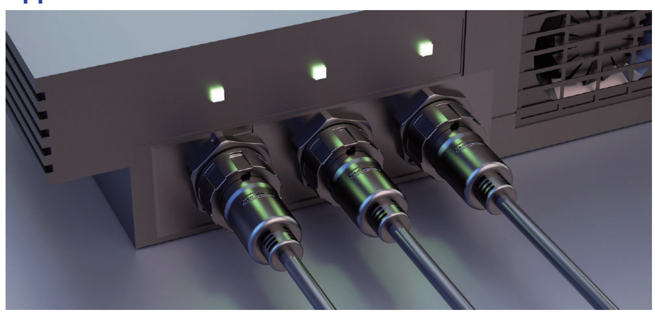
YU-USB series products are used in an automation equipment control box