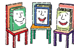
St. Paul's Readers

St. Paul's Readers is on summer hiatus until September. This break most certainly does not mean that we are no longer reading, but rather using our long, slower summer days to savor our books even more. Recent books in my collection have moved me profoundly – prompted shifts in my thinking, made me less strident, taught me something new, or offered points of view that I had never considered. Fictional characters gave me insight into situations that I never encountered, enlightening me as to why people might make certain choices or take actions outside the norm.