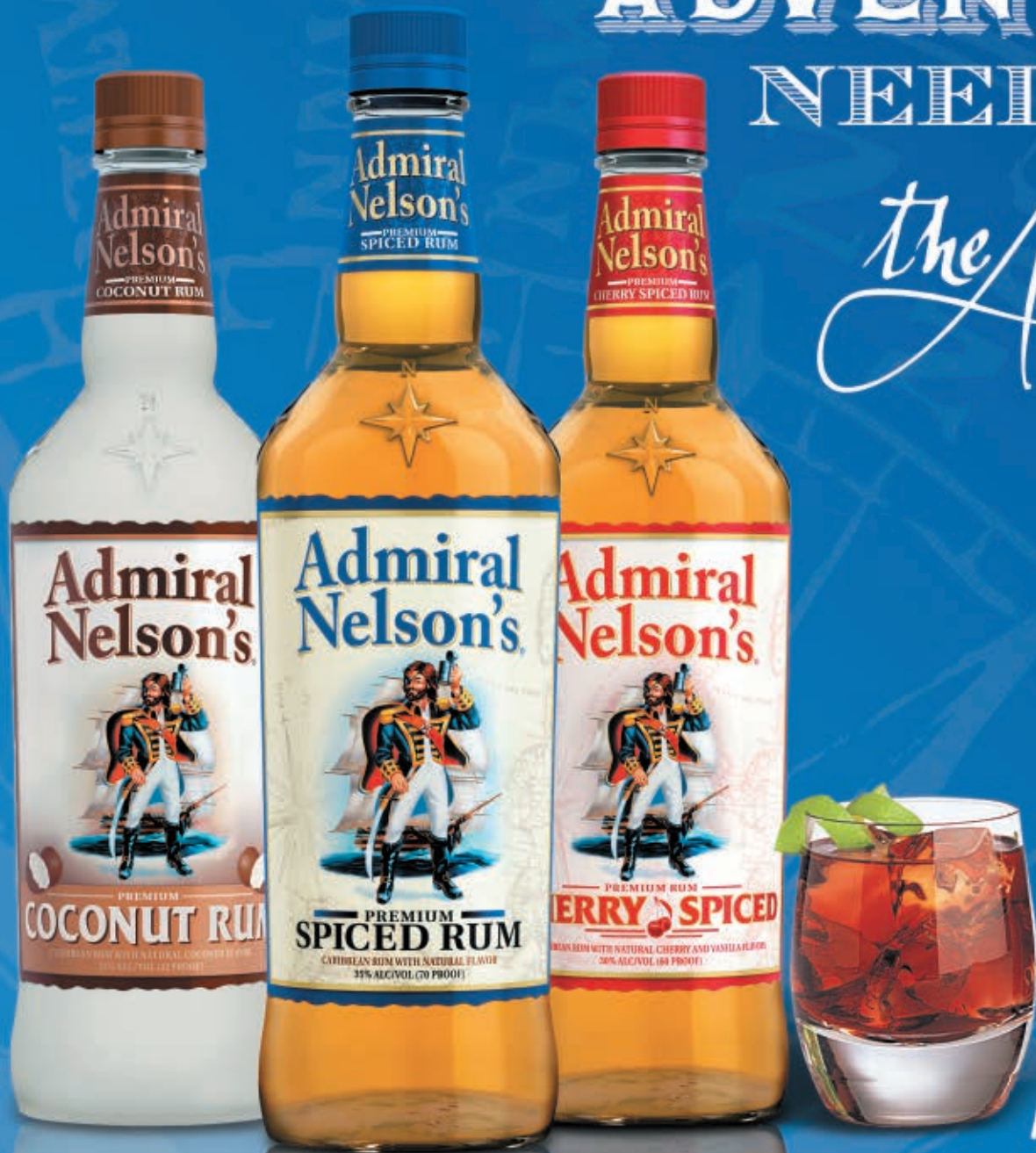
CHART YOUR OWN COURSE. TM