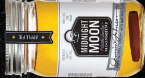
66105 APPLE PIE