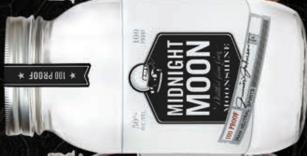
66097 100 PROOF