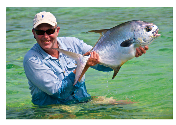
May 26-June 2 Cayo Cruz – Cuba

evenings learning tactics for successful permit fly rodding from one of the most passionate and accomplished permit angler's in the world. Trip fees include lodging, guided fishing, meals/soft drinks, exclusive expedition workshops & activities, a trip shirt and all of the other benefits of the Avalon Cuban Fishing Centers experience.