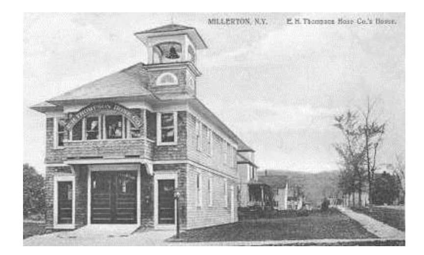
The Millerton Village Hall was once the Millerton, NY C.H. Thompson Hose Company

Meeting Schedule Village Board 3rd Monday of the month at 7 PM Planning Board 2nd Wednesday of the month at 7 PM Zoning Board of Appeals Meets as needed