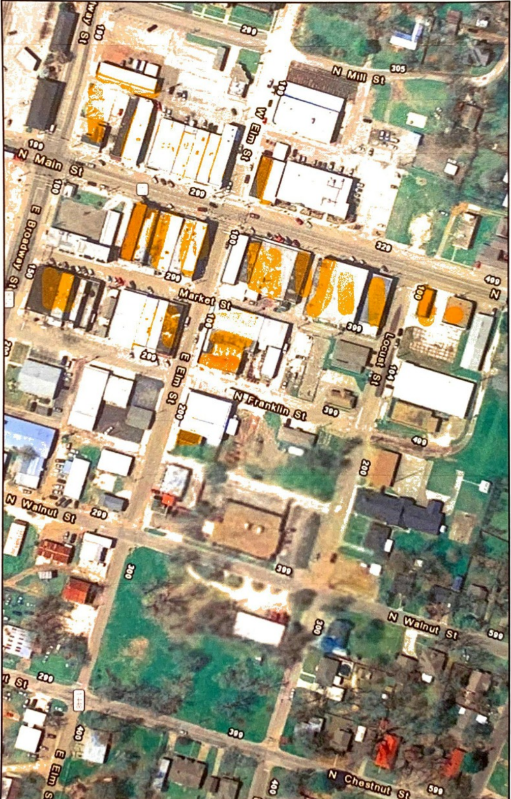
Wood CAD Web Map

SPECIAL RELEASE TO THE TRAILS COUNTRY REPORTER & PRODUCTIONS Notice: This document was obtained directly from a city official And not through open records; it is not currently vetted as to its accuracy, but THIS document was present at the Winnsboro Planning and Zoning Meeting on 8/20/2020 and not provided To the public in meeting materials nor is discoverable on the City website as of 9/13/2020.