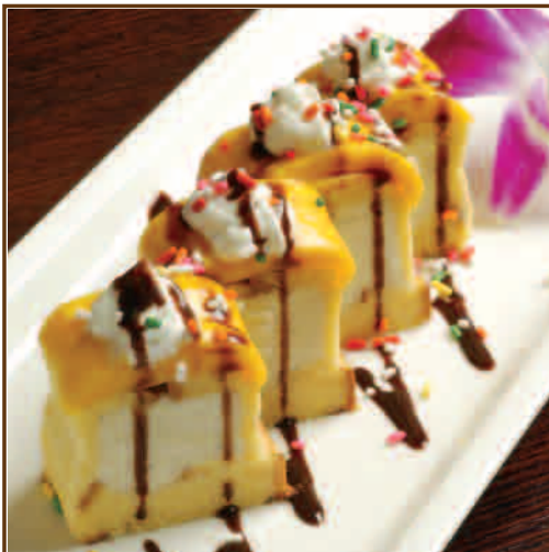
Sushi Ice Cream

Mochi Ice Cream (2 pcs) 5.00 Flavor Selection: Strawberry, Mango, Green Tea, Vanilla Green Tea Ice Cream 5.00 Mango Ice Cream 5.00 Tempura Ice Cream 8.00 Flavor Selection: Green Tea or Mango Sushi Ice Cream (4 pcs) 8.00