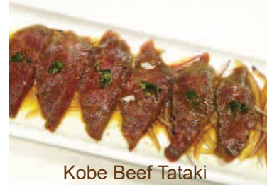
Kobe Beef Tataki

Kobe Beef Nigiri 17.00 hand torched with sea salt and fresh wasabi