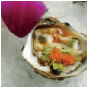
Fresh Oyster (2pcs)