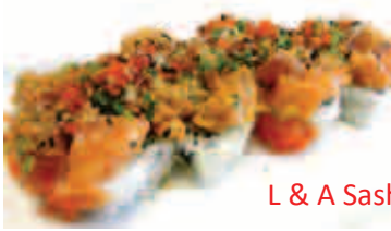
L & A Sashimi