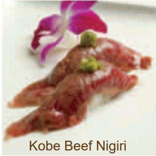
Kobe Beef Nigiri