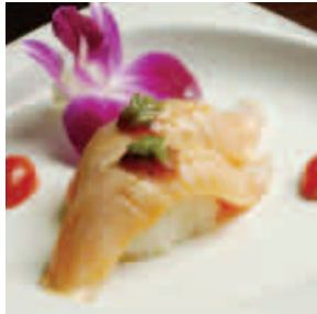
Spring Salmon Belly