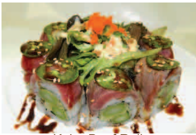
Kobe Beef Roll