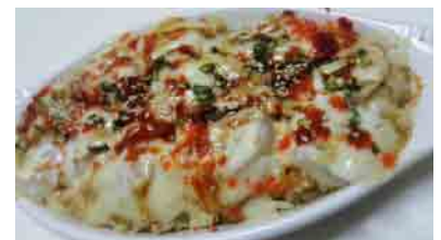
Fried Rice Baked with Scallop