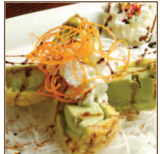
Tempura Ice Cream

*No outside food allow.* * We reserve the right to refuse service to anyone. * *Not recommended for people who are allergic to seafood or spices* **Consuming raw or uncooked meats, poultry, seafood, shellfish or eggs may increase your risk of foodborne illness, especially if you have certain medical conditions**