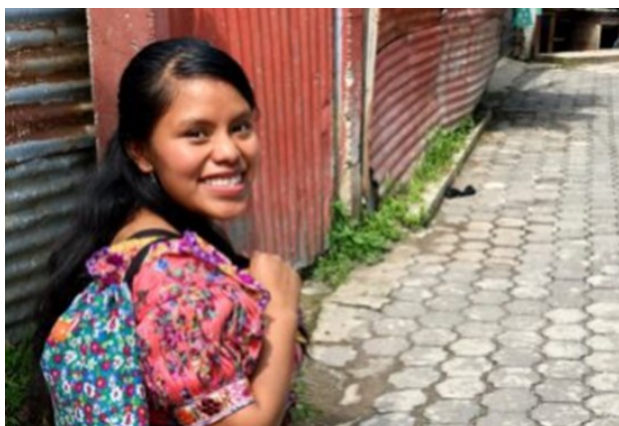
This young lady, who is sporting a kit over her shoulder, would not be able to attend school if it weren't for Days for Girls.