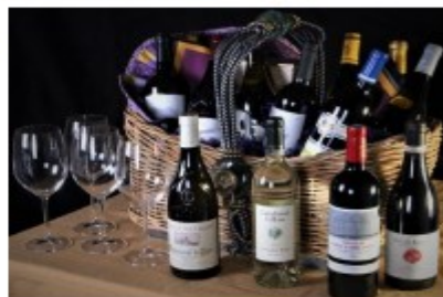
First Place Basket

A description of wines (all rated above 90 points) is available on our website.