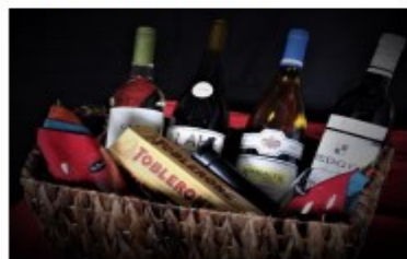
Second Place Basket

Drawing will be held on February 10, 2021